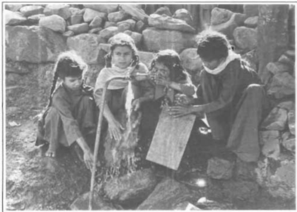
Pakistani girls enjoy the minor miracle of a new water tap, after horizontal drilling made it possible to release water trapped within a mountain. Children and women, who usually have the chore of fetching water, are among the first beneficiaries of the new water supply scheme. UNICEF's involvement in rural water supply, to which the Government of Pakistan attaches a high priority, is rapidly increasing.

springs, and the construction of simple gravity-flow systems to standpipes.