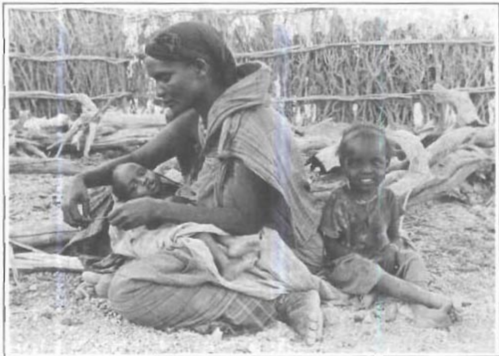
A weary mother and her children rest after their arduous journey to one of the more than 20 refugee camps in Somalia. Survival is a day-to-day struggle for the mothers and children in these camps. Although its main emphasis since the 1950s has been on long-range development programmes, UNICEF continues to carry on emergency relief work to meet the particular needs of children affected by natural or man-made disasters.

disaster relief, and with governments, the European Economic Community, ICRC, the League of Red Cross Societies and other voluntary agencies. A stockpile of 300 commonly-needed relief items in the UNICEF Packing and Assembly Centre (UNIPAC) in Copenhagen are drawn on by UNICEF and other agencies participating in relief efforts.