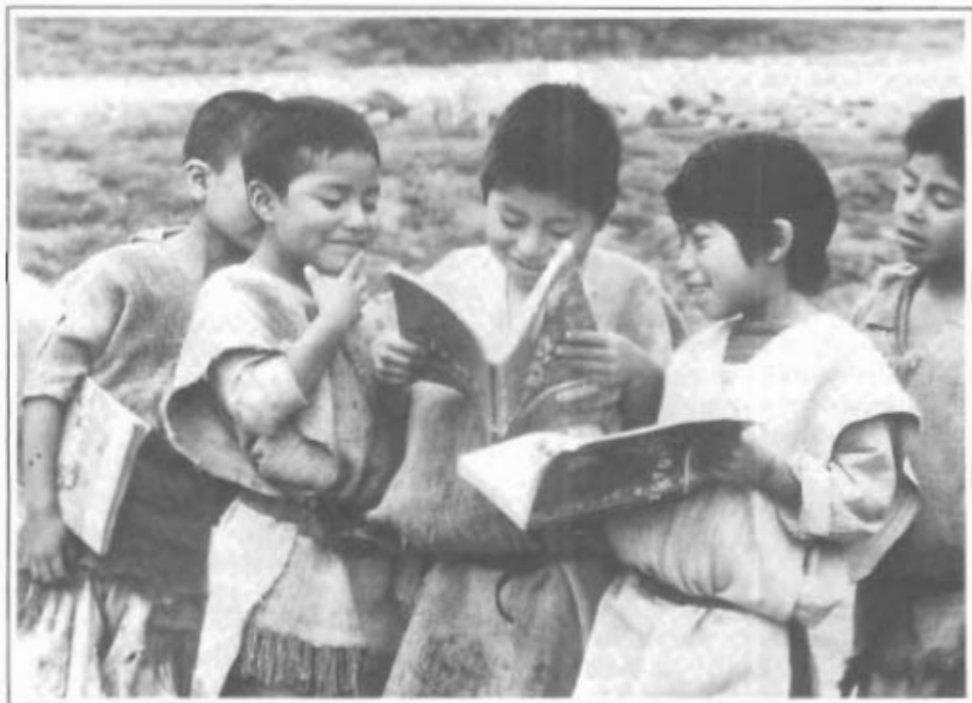
In Mexico, these children from the highlands of Chiapas are benefiting from the Government's comprehensive rural development programme, which takes advantage of opportunities for services benefiting children to be built up as part of the social component of development. The object of UNICEF co-operation has been to develop co-ordinated programmes to improve living conditions in marginal rural areas and to draw people into the integrated development of the country.

made a commitment to basic services as the way to meet children's needs at a Regional Symposium on Services for Children organized by UNICEF's Eastern African Regional Office in 1979. It was attended by delegations from 18 countries.