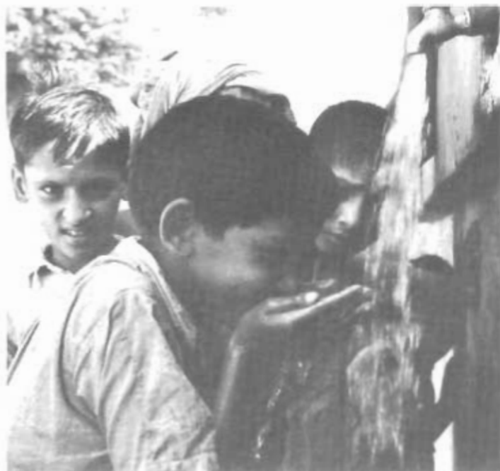
A basic step in meeting the needs of children is a supply of safe drinking water. Yet 90 per cent of children in developing countries live in areas without a protected water supply, and water-borne diseases are a major cause of illness and death among young children. UNICEF assists village water programmes in 54 countries (above, India).

ing countries lack access to clean drinking water.