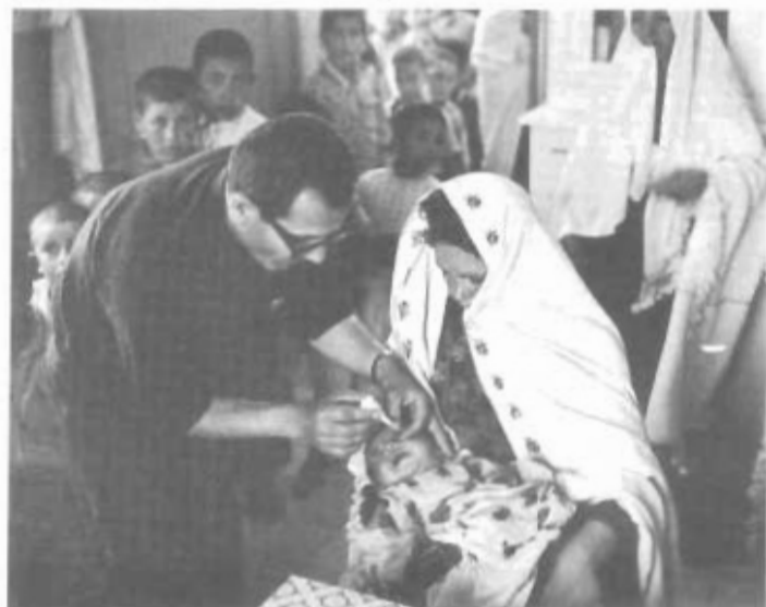
Maternal and child health services are the third basic need of young children. Many can be provided by auxiliary health workers. Curative services respond to obvious needs, and can lead on to preventive work. UNICEF is helping maternal and child health services in 97 countries. (Above, a trachoma treatment, Jordan.)

1972 four more countries prepared for this step through their health planning or pilot projects. Working towards the same objective, the United Nations Fund for Population Activities channeled $1.8 million through UNICEF in 1972.