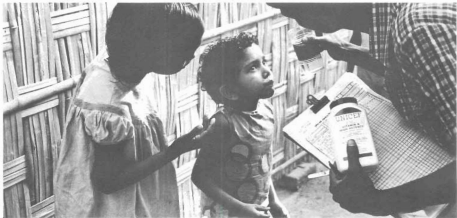
In 1972, mass prevention of blindness due to Vitamin A deficiency in young children began in Bangladesh, India, Indonesia and the Philippines, all in the Vitamin A deficiency belt of Asia. It was made possible by a new technique of distributing and administering a large dose of Vitamin A every six months. In Bangladesh (above), the network of malaria field workers distributes the capsules, and the plan is to begin preventive treatment of all 15 million children under five by the end of 1973.