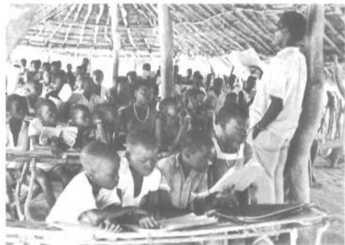
A bush school in the Sudan resumes operation after the end of the long civil conflict. Following emergency relief operations, UNICEF usually turns to help in rehabilitation, especially the restoration of disrupted health and educational services.

In emergency relief, UNICEF co-operates with the United Nations Disaster Relief Organization (UNDRO), and the International Institutions of the Red Cross.