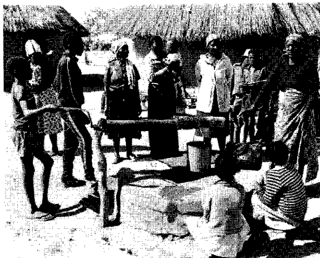
Village Health Worker discusses well protection and importance of clean drinking water with community.