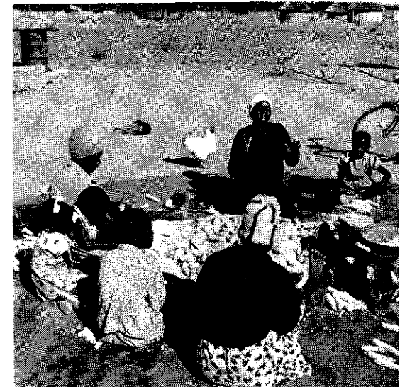
Village Health Worker advises a family on home hygiene.

IN ORDER TO FUNCTION EFFECTIVELY THE VILLAGE HEALTH WORKER NEEDS STRONG SUPPORT FROM HEALTH PERSONNEL: HEALTH ASSISTANTS, MEDICAL ASSISTANTS, NURSES, HOSPITAL ADMINISTRATORS AND DOCTORS.