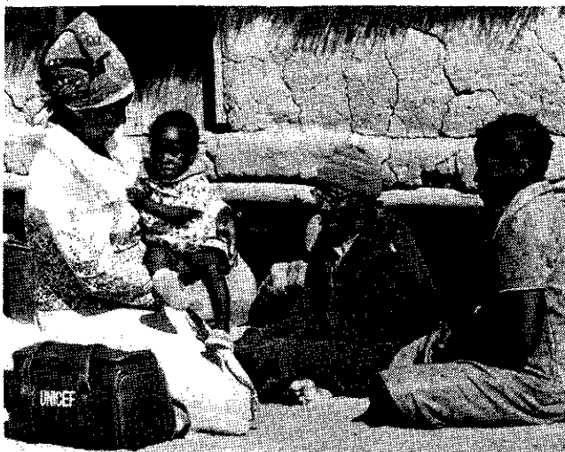
Village Health Worker advises young mother on the health of her child.

This approach implies a shift of emphasis from the past curative, expensive approach which served limited selected areas, whilst ignoring the rest of the country, to an approach that emphasises prevention, is evenly distributed and involves community participation.