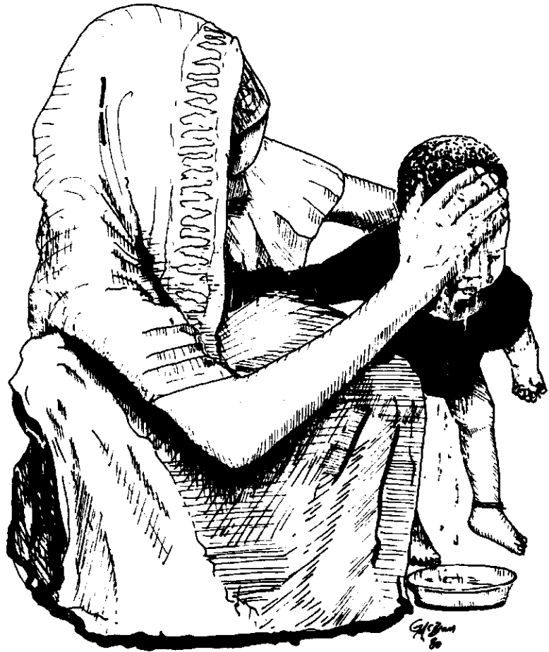
eyes are infected, the mother did to help the child.