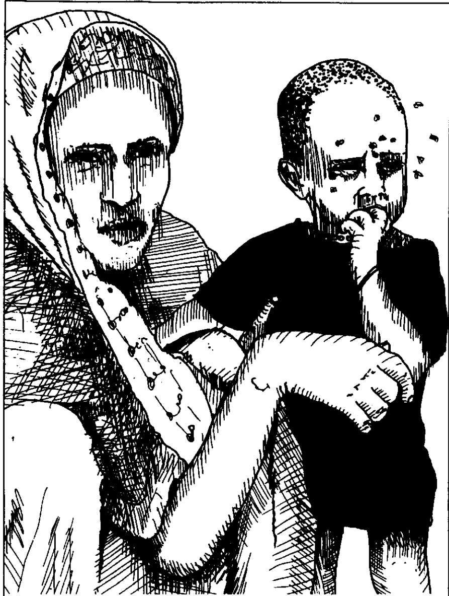
This child's eyes are infected, the mother did not know how to help the child.