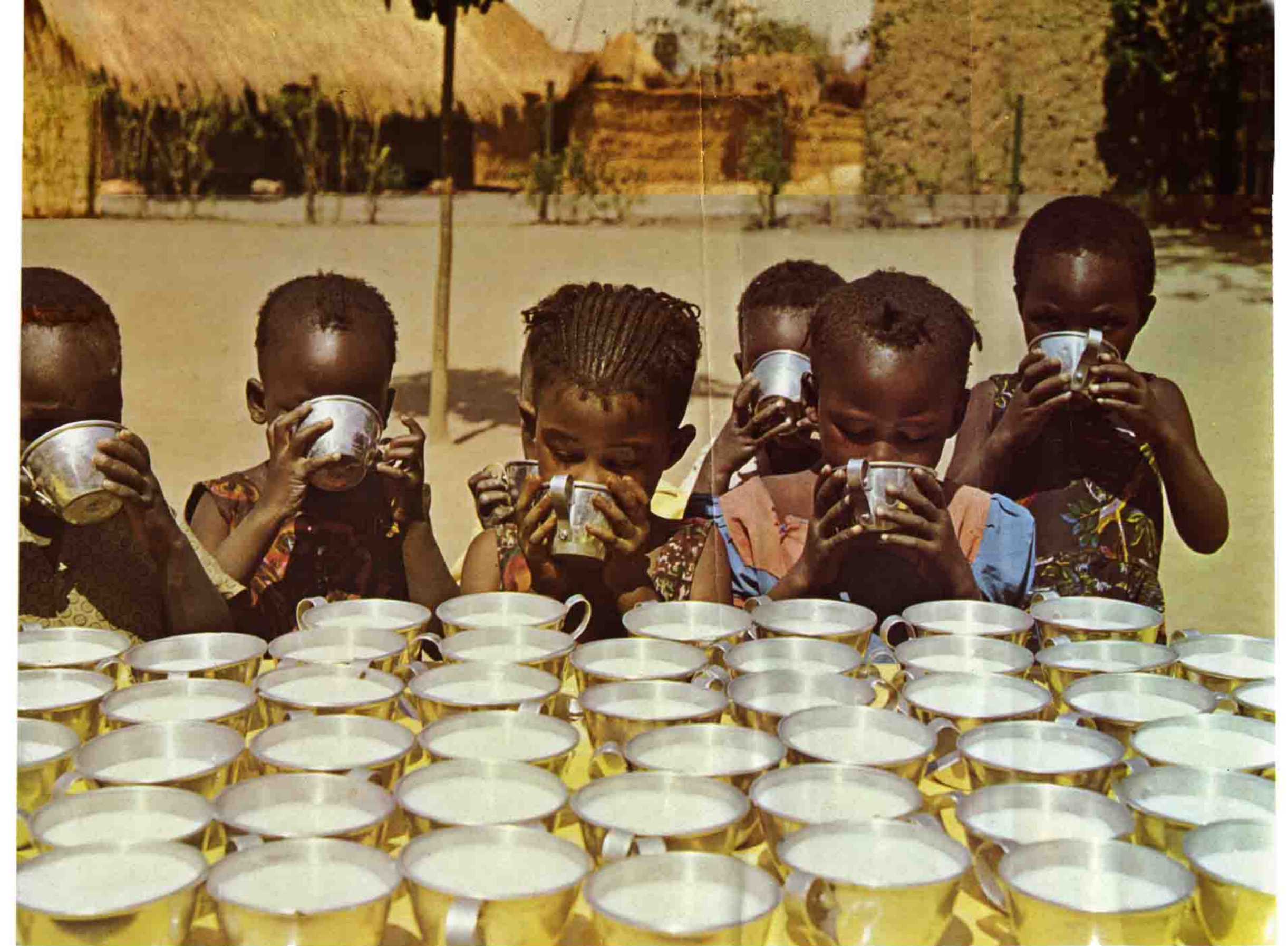
"In its early years, the glass of milk became a symbol of UNICEF activities . . . easing the hunger pangs of 500 million children. . ."

UNICEF Executive Director Henry Labouisse, accepting Nobel Peace Prize