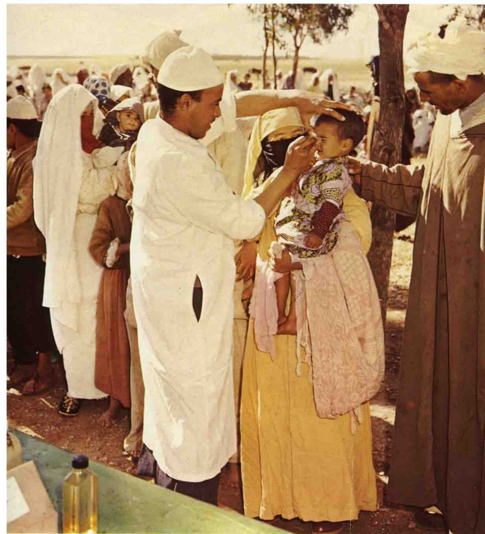
"We might mention the 10 million children who were treated for the tremendously infectious complaint of the eyes known as trachoma. . ."

"Some 30,000 health centers for children and mothers have been organized by UNICEF. . ."