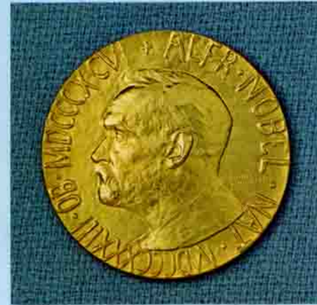
Nobel Peace Award, 1965

"Everyone has understood the language of UNICEF . . . Even the most reluctant person is bound to admit that in action UNICEF has proved that compassion knows no national boundaries. Aid is given to all children without any distinction of race, creed, nationality or political conviction . . . UNICEF has become an international device capable of liberating hundreds of millions of children from ignorance, disease, malnutrition and starvation . . . The aim of UNICEF is to spread a table decked with all the good things that Nature provides for all the children of the world . . . UNICEF