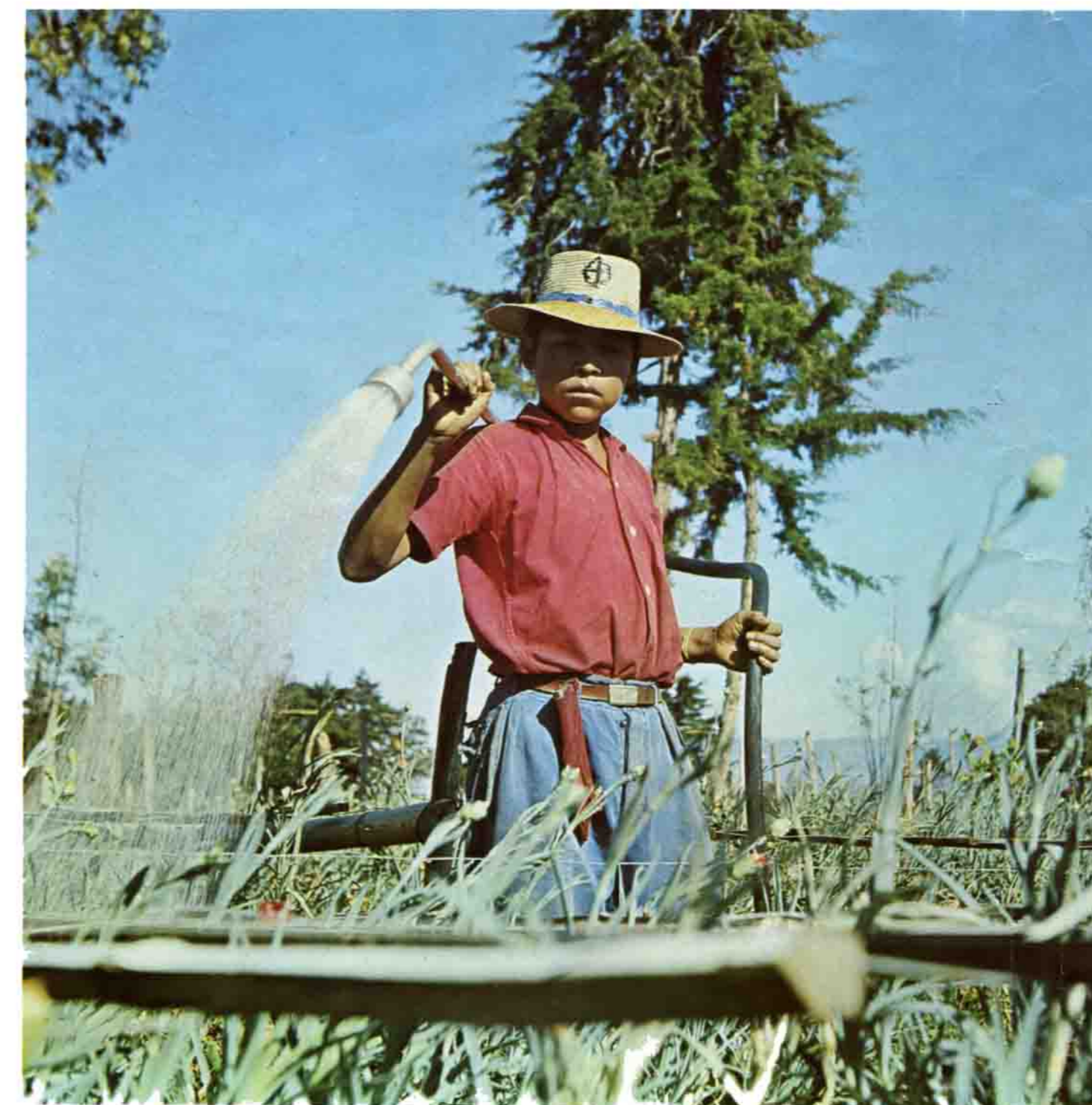
"The child of today is the farmer, the teacher, the politician and the worker of tomorrow. . ."

"To create a peaceful world, it is necessary to begin with the children. . . Feeling is growing everywhere that we are, in reality, one family in the world."